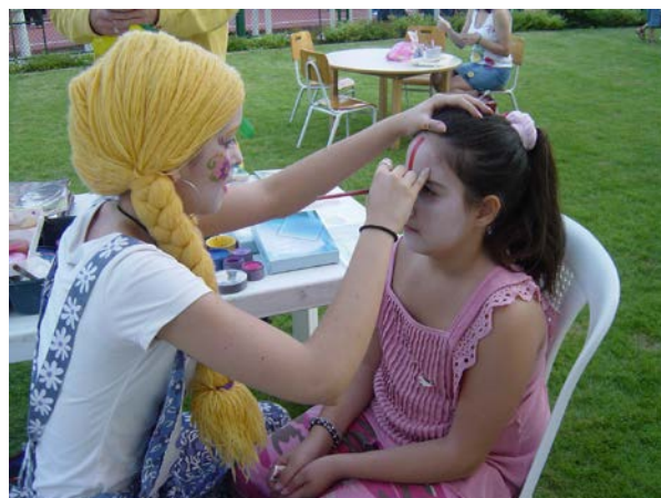
Fun-Fair (Kermesse) activities