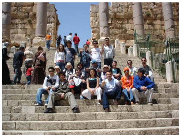
A school-trip to Baalbeck