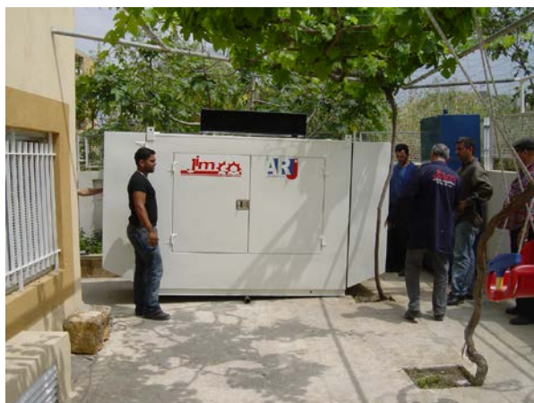
Installation of the Electric Generator