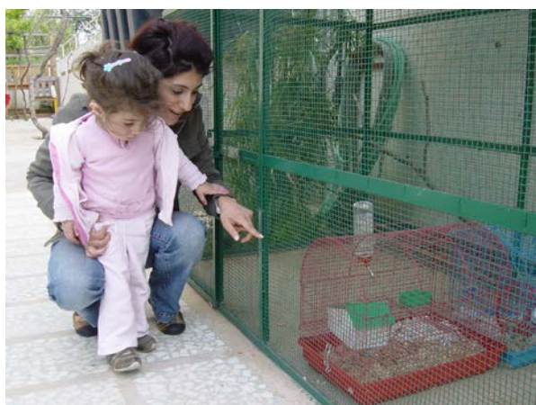
Mother and a child at the LCD