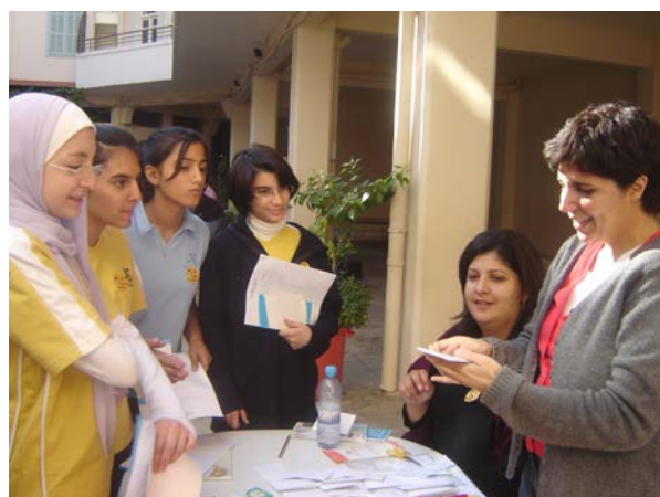
Awareness about deafness in a regular school