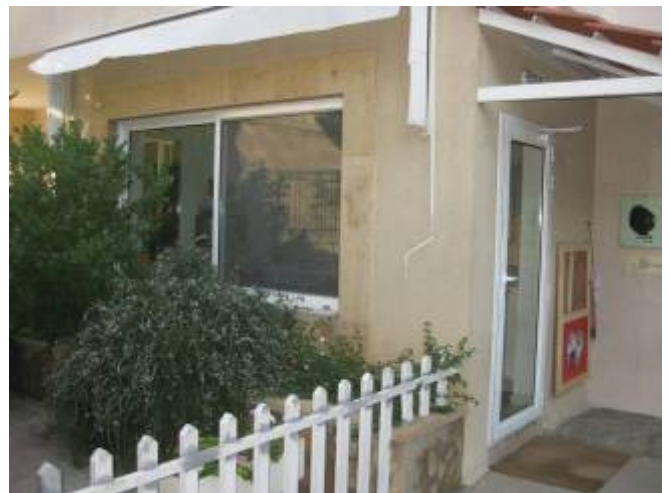
Windows & Doors with Sound Proof System