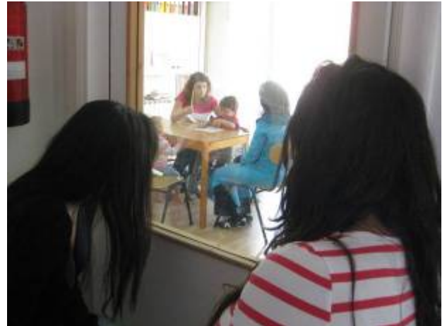
Observing the EIP Sessions