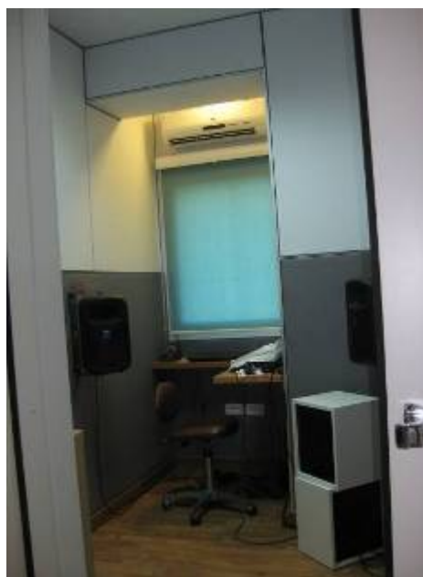
New Audiology Room