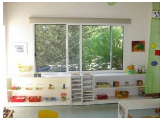
Maintenance works: painting