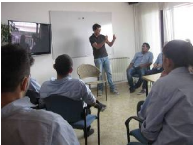
Drama lessons conducted by a deaf instructor