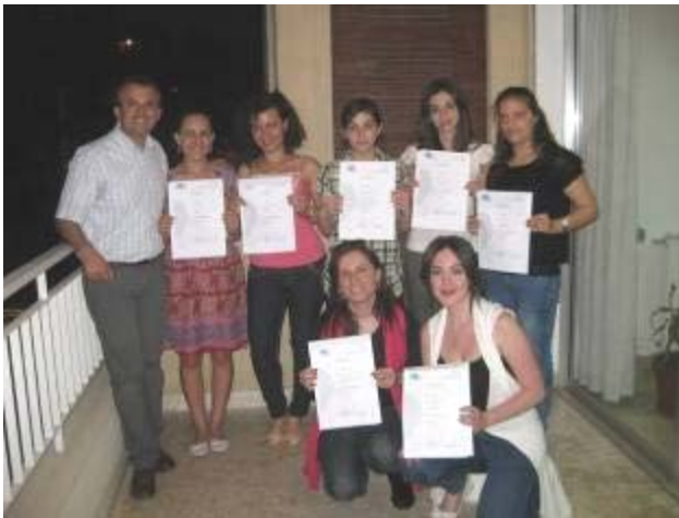
Sign language diplomas

6. Consultation , which provides consultations and advice for families of deaf children, as well as to deaf adults.