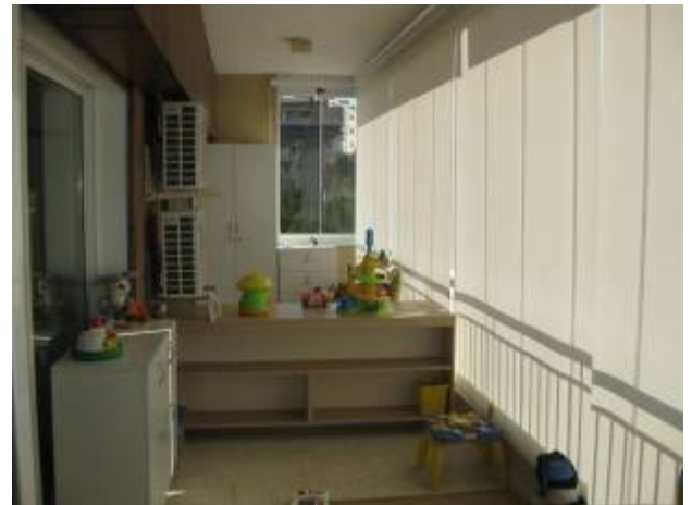
One of the closed balconies turned to a class