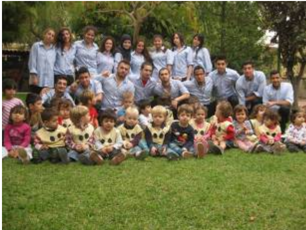
Two different group generations