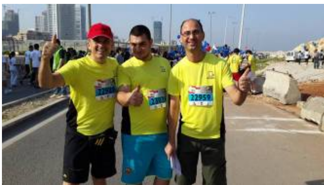
Participating a Marathon fun run