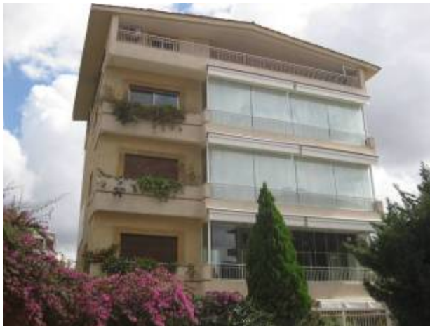
Glass Curtains with sun shades for 3 balconies