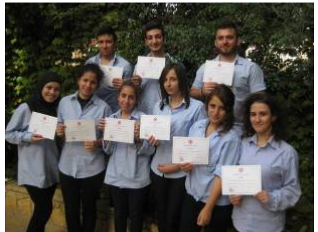
Certificates issues by the Red Cross