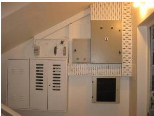
Electrical Works at the Main Outlet, completed