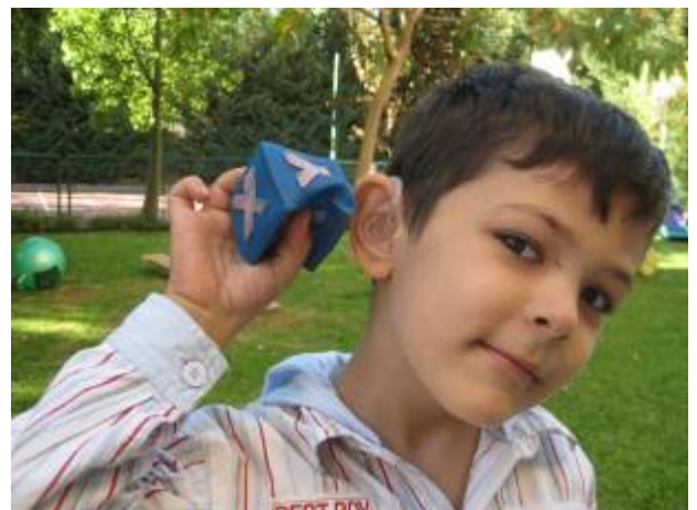
Experiencing a new hearing aid