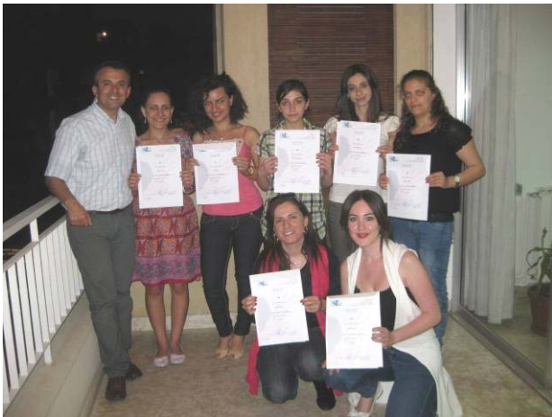
Sign Language Diplomas