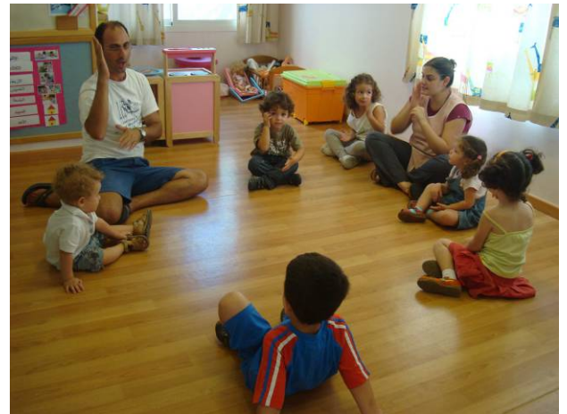
Sign language activities for the children