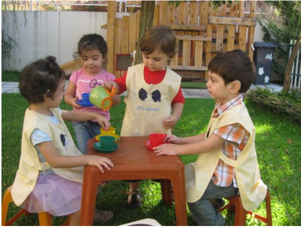
Children at the Integrated Nursery