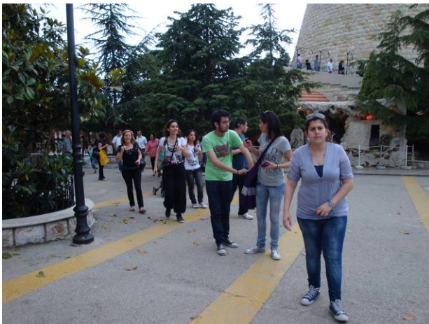
A School Trip to the North