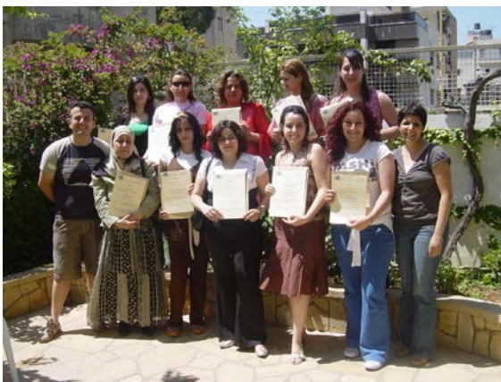
Graduation of teachers for the Deaf