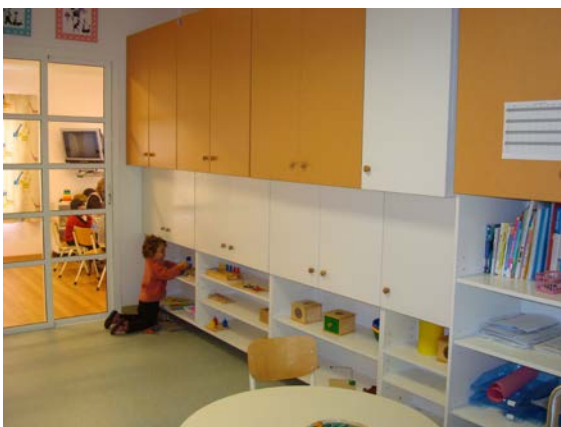
Project work for the Integrated Nursery