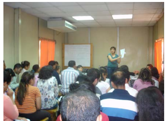
Training Teachers for the Deaf, Cairo, Egypt