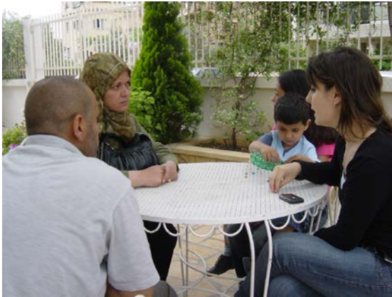
Consultation for the families