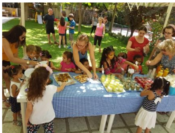
Party time for the children and family members