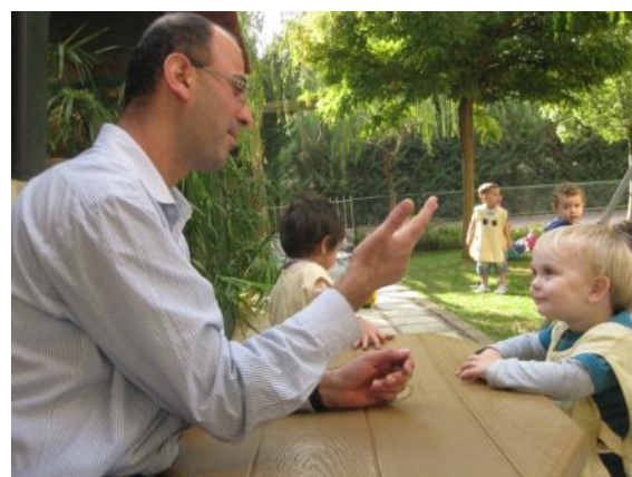
Teaching Sign Language to Children