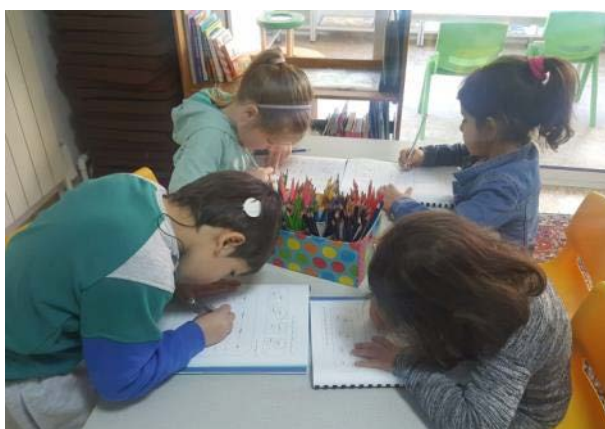
Activities in the Preschool