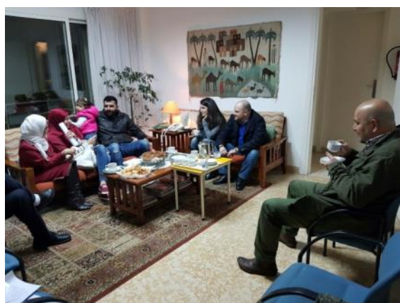
Consultation for families of deaf children