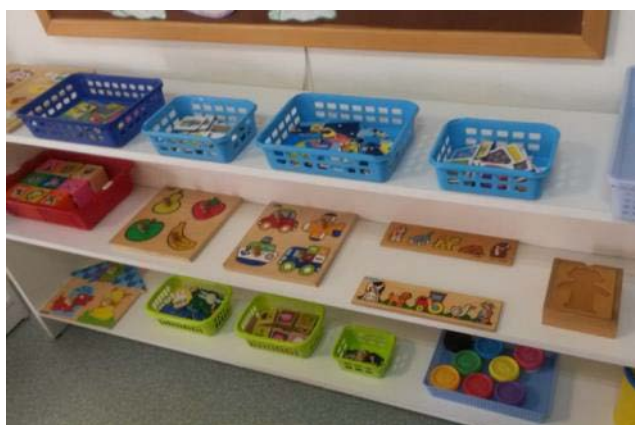
Educational Material in the Classes