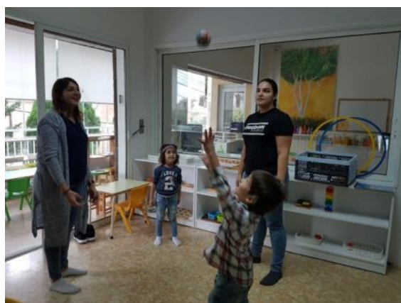
Occupational Therapy Session