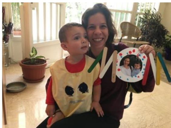
A gift to mom