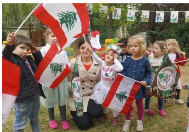
Celebration of the Independence Day