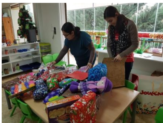
Donation of Educational Material to the LCD