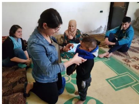
Home Visit to a Syrian Family