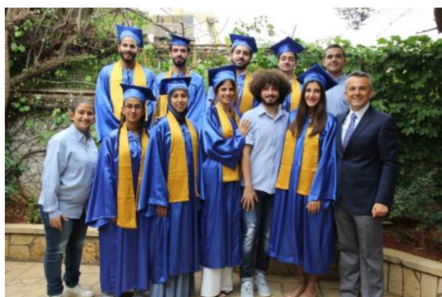
Graduation Day for the High School Students