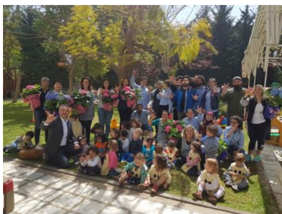
Celebrating Mothers' Day