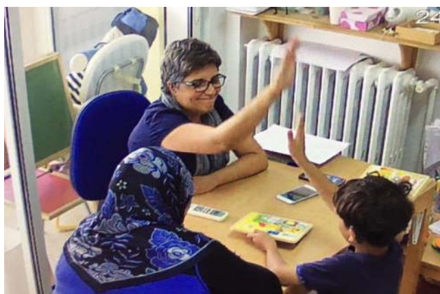
A session in the Early Intervention Program