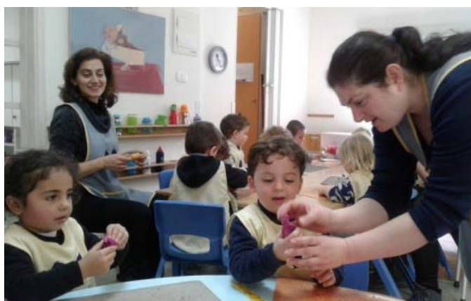
In the Nursery