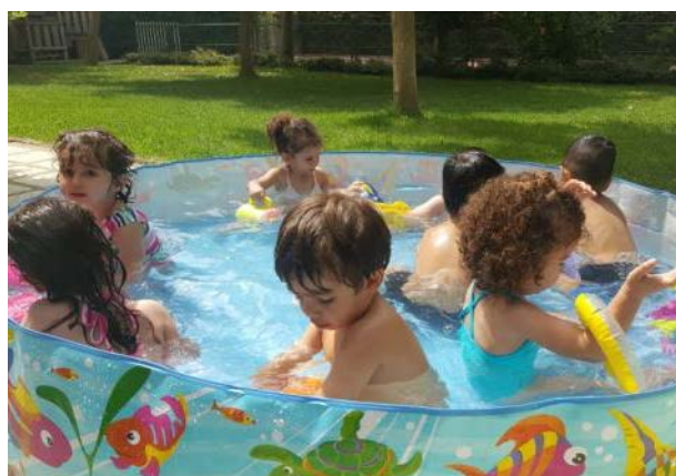
Nursery Activities in the Summer