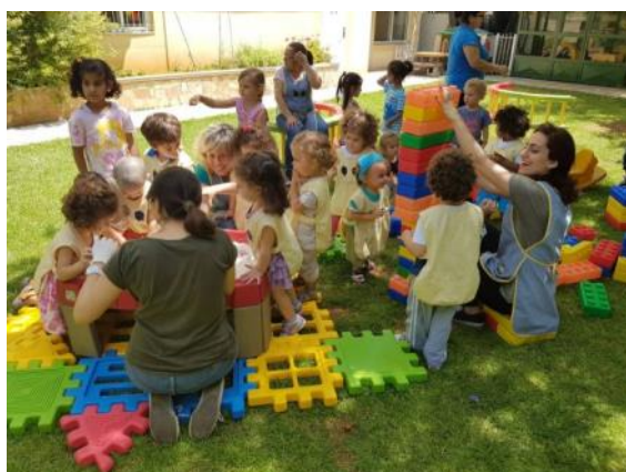
Activities in the Playground