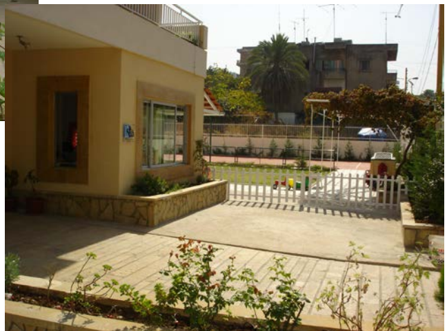
New Playground Facilities