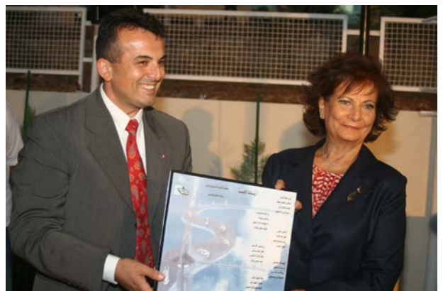
First Lady of Lebanon, during the Opening Ceremony