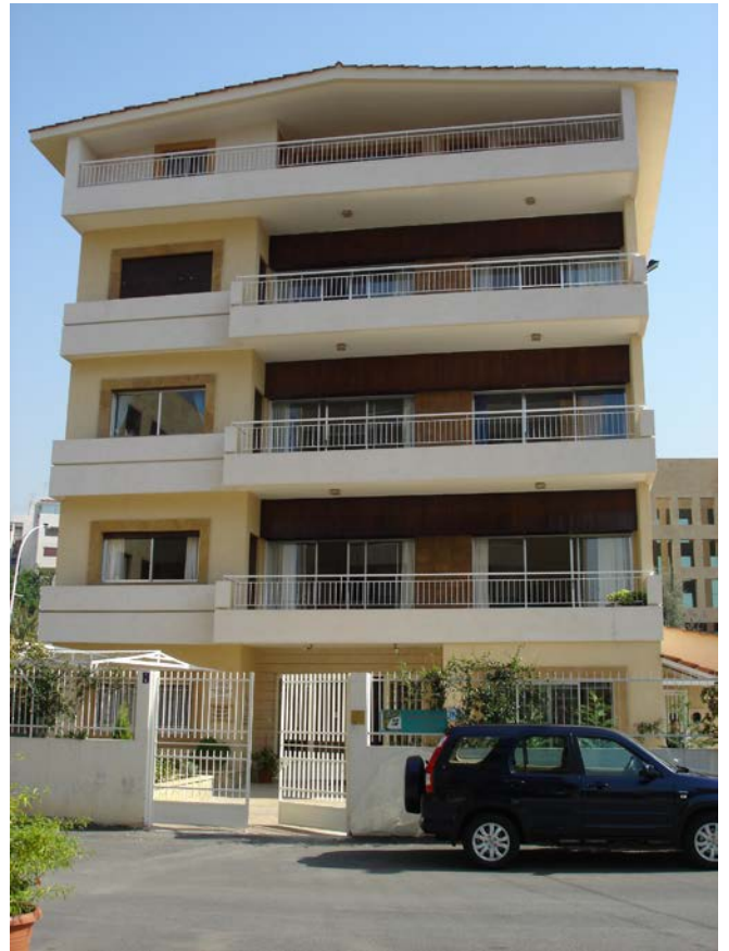
LCD's Building – After Renovation