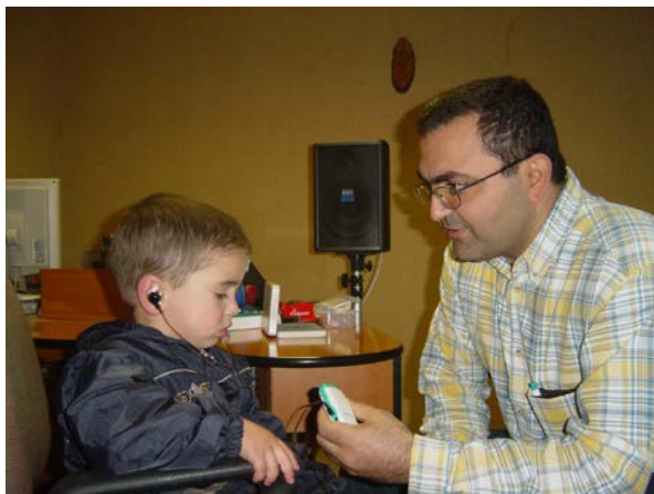
Hearing Aid fitting, supported by Liliane Fonds