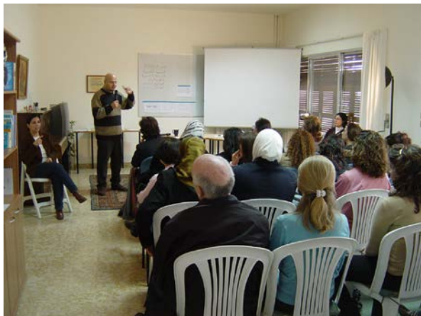
Lectures for Parents