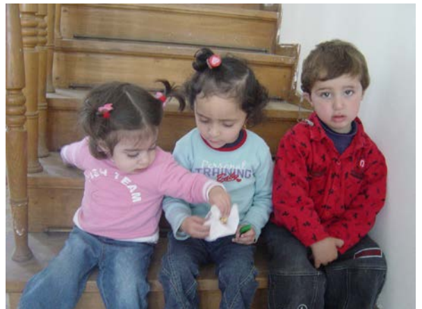
Deaf children of EIP