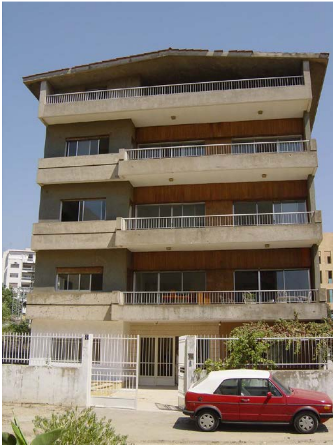
LCD's Building – Before Renovation