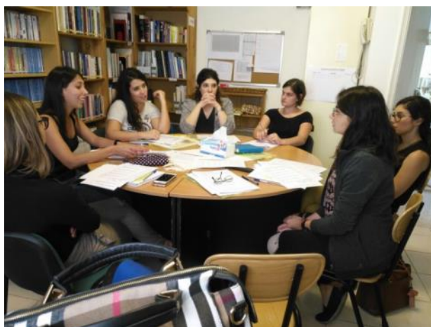
Training Session for the LCD's Team