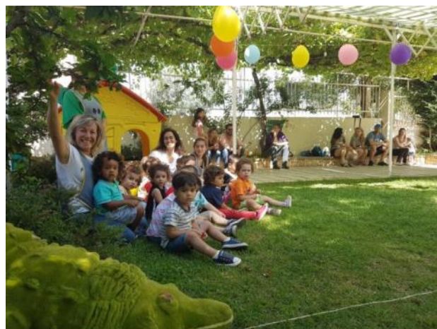
Party time for the children