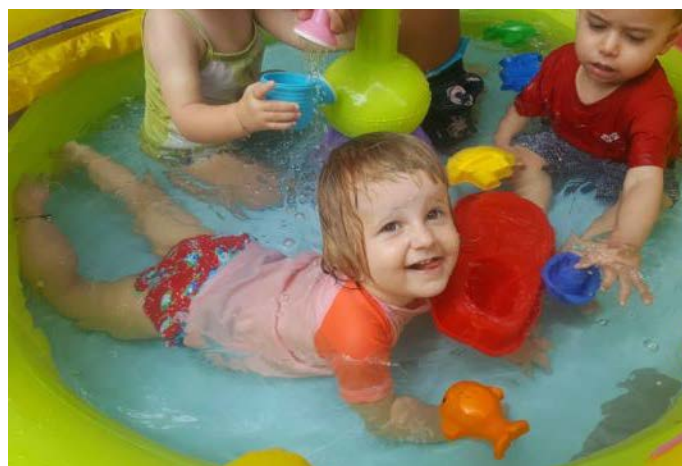
Nursery Activities in the Summer