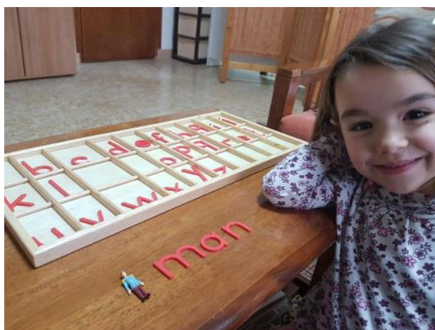
Preschool child constructing words