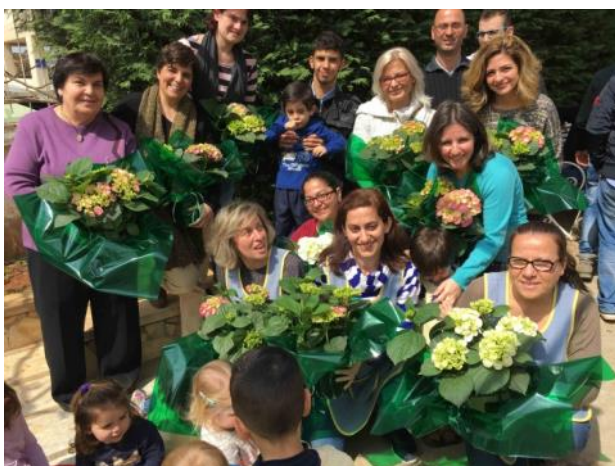
Celebrating Mothers' Day