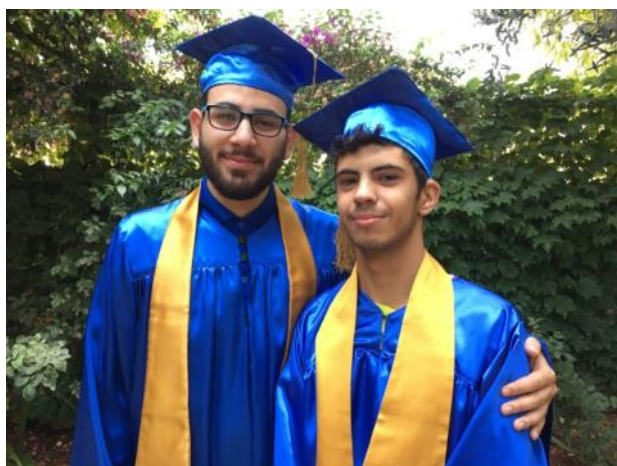
Graduation of the High School Students