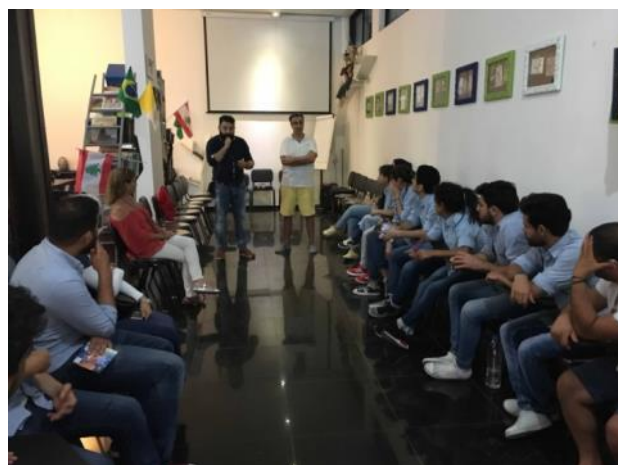
Visiting to a Rehabilitation Center for Addiction