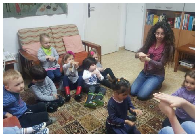
Teaching Sign Language to Preschool Children