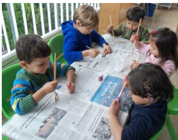
Activities in the Preschool