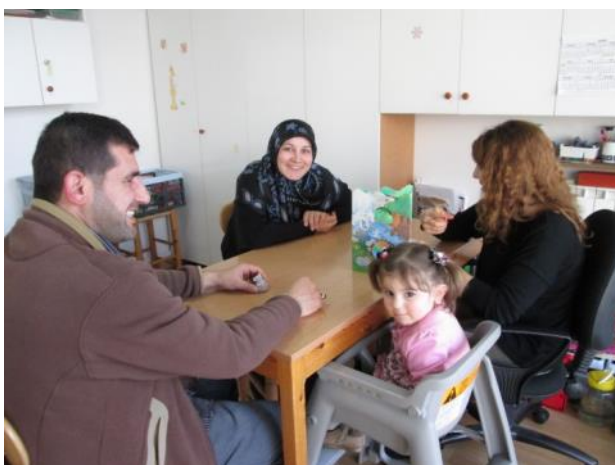
Early Intervention Program