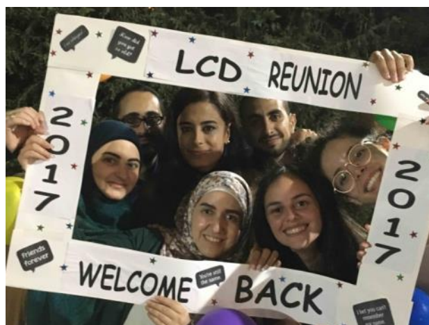
Reunion of the High School Students