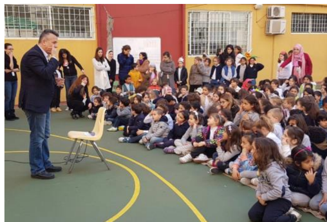
Awareness Activities in a regular setting