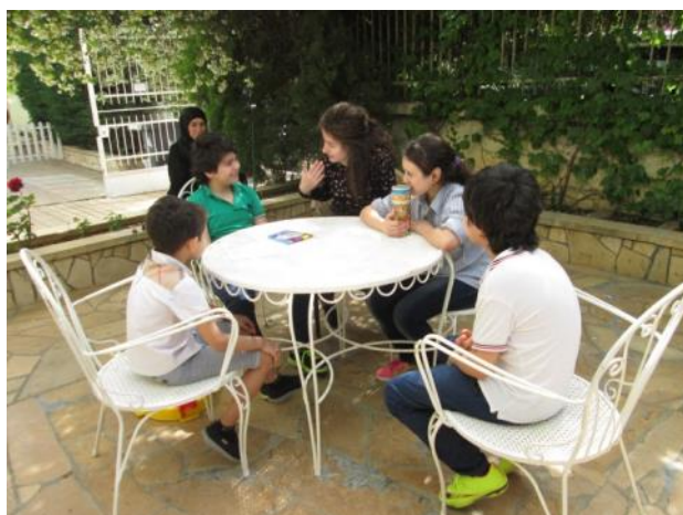
Early Intervention Program – Older Children