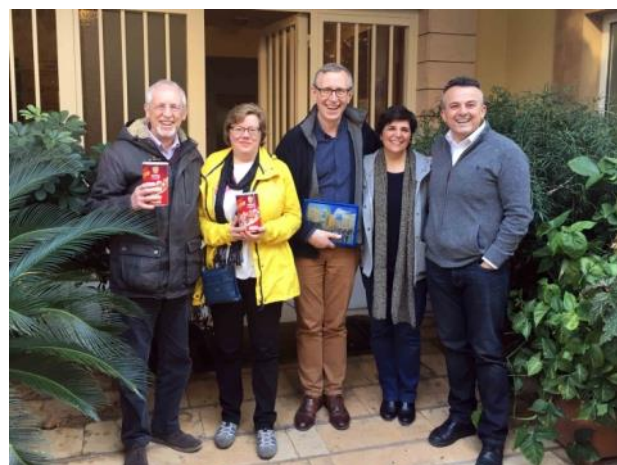
A warm visit of the Embrace-UK