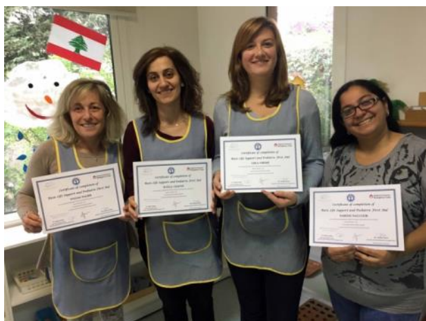
Nursery and Preschool teachers