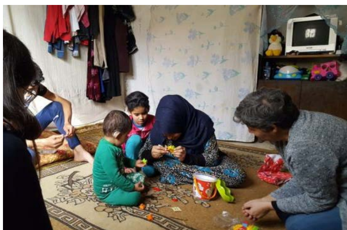
Home Visit to Syrian Family